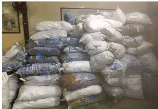
Davao, Mindanao Relief Operations